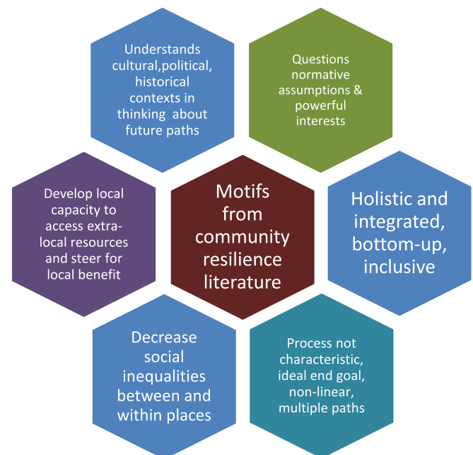
Diagram. 1 Critical motifs in resilience literature.

p.480). A community resilience framework has potential to offer an integrated and holistic approach that acknowledges the complexity of, as well as the sometimes non-rational or—causal processes of change (Wilson, 2013). Resilience, then, provides a 'bridging concept' rather than an off-the-shelf rural development model (Davoudi, 2012 in Scott, 2013). By thinking through resilience as a way to re-frame rural development as neo-endogenous or networked, the idea of 'deliberative place-shaping' (Healey, 2004 in Shucksmith and Talbot, 2015) brings a focus to the agential and forward- or outward-looking features of community resilience and the need to develop that 'vision' or 'development path' from a place's sense of history and unique identity. Boschma (2015), though not focusing on specifically rural regions, stresses that regions cannot move away from their history or path dependence altogether, but that it is a factor in how and what new growth paths are possible.