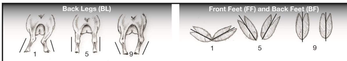
143 144 Figure 2. Scoring criteria used for the leg and feet traits.

131 The leg and feet traits are shown in Figure 2. The scoring for the front legs was similar to that 132 shown for the back legs. A score for both the Front legs (FL) and Back legs (BL) of 5 133 represented legs that were completely straight. Animals with legs that pointed inwards at a 134 severe angle, resulting in the hocks (BL) or knees (FL) nearly touching, would be given a 135 score of 1 where as those completely the opposite, with the hocks/knees a large distance apart 136 and forming bowed legs, would be scored as a 9. The Front feet (FF) and Back feet (BF) 137 scores describe the direction that the hooves were facing when the animal was standing 138 (Figure 2). A score of 1, considered to be the worst score for both FF and BF, represented 139 hooves that were facing away from each other. A score of 5 represented hooves pointing 140 outwards, but at a less severe angle. The best score for both FF and BF was 9 and was given 141 to animals with both hooves pointing straight forward. In addition to the conformation traits, 142 test day milk yield and cumulative milk yield data, up to day 305, were also available.