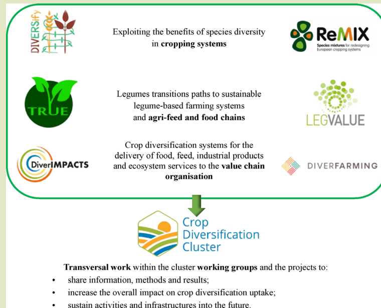
Fig. 2 Relationships between crop diversification cluster projects.

benefits of crop diversification in terms of productivity, ecosystem services and market opportunities;