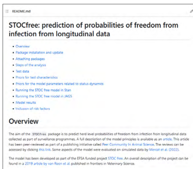
Figure 2 The documentation for the STOC free framework on Github ( https://github.com/AurMad/STOCfree )

The STOC free model was developed using simulated data [9]. It was further tested and validated using French data with bulk milk BVDV test results and risk factors related to the number of cattle introduced [6].